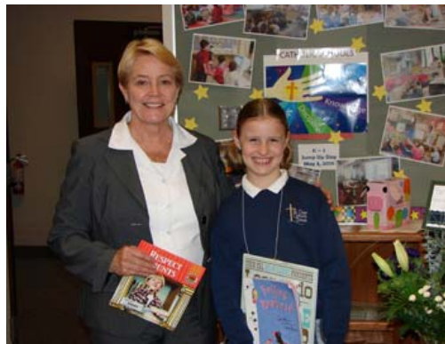
Our two Principals!

http://www.stcroixcatholic.com/endowment.aspx