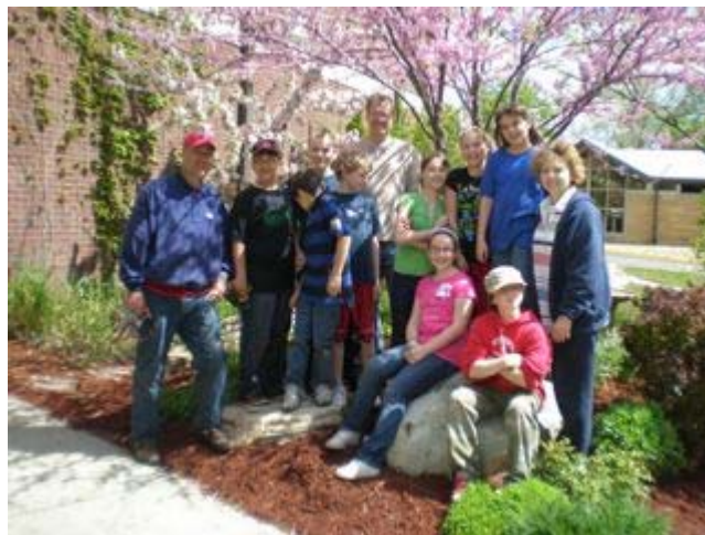
The Garden Crew on May 1, 2010

Our 5th Grade Plant Sale will be held again during the school Carnival. Please come ready to shop for some hardy perennials, lovely annuals, and creative plantings.