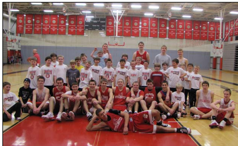
The whole group of Pony Pals and Pony players