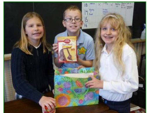
Cake mix and frosting are the beginning of a "Happy Birthday" surprise.

Fifth grade students made treat bags for veterans living at the Minnesota Veteran's Home. They filled 40 bags with items such as snacks, games, socks, pencils and a card or note.