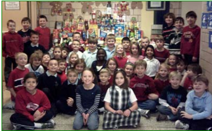
Second graders sitting in front of the food they collected for St. Michael's Food Shelf.

Last week in recognition of Catholic Schools Week, SCCS students were busy collecting, sorting, and packaging various items to be donated to community organizations that help those in need in our community. Our youngest students in kindergarten, first and second grade collected food for St. Michael's Food Shelf.